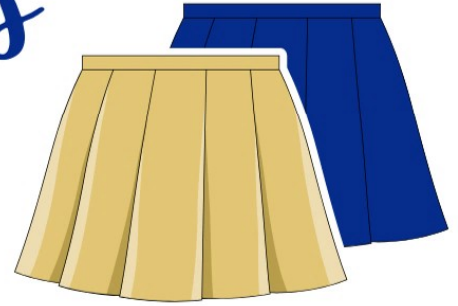
Skirts and Dresses: khaki or navy