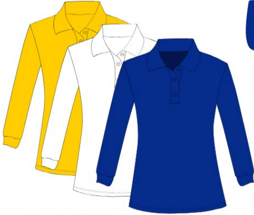
Long Sleeve Polos: white, navy, gold