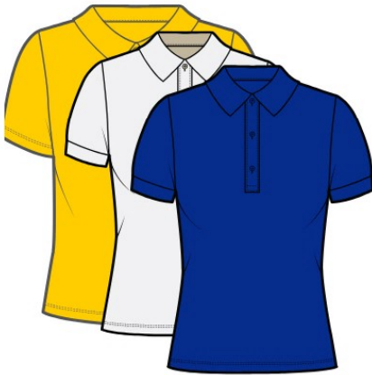
Short Sleeve Polos: white, navy, gold

Shirts with Logo: highly encouraged, not mandatory tinyurl.com/ColesKES