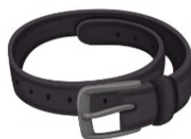
Belt: black Mandatory for ALL Students