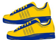
Shoes: No Crocs No Slides